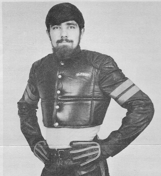
Pictured above are our new Hi-Point leathers, chest protector and moto-cross jacket. The leathers come in either black or gold, No. 402. The chest protector is green with gold stripes, No. 401. The moto-cross jacket is black with either red or gold stripes, No. 403.